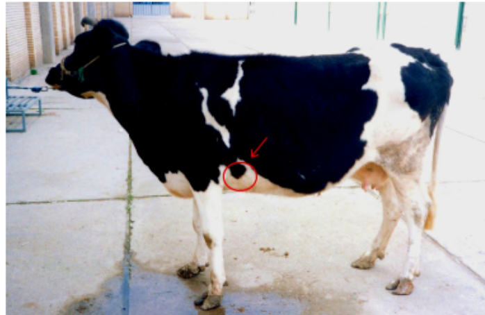
Fig. 1: Abscess position (arrow)

a common complication of TRP. In addition, if the foreign body migrates through the diaphragm and into the pericardium, it can cause septic pericarditis and result in a subsequent congestive heart failure. Some wires have an unusually pattern of movement in some cases and make less common complications include reticular fistulation, vagal indigestion and diaphragmatic hernia (Rebhun, 1995; Ibrahim and Gohar, 1988). There are few references to the clinical diagnosis and management of thoracic abscesses in cattle (Braun et al. , 2007, 1998, 1993a). The purpose of this study was to introduce unusual cases of traumatic reticulitis which appears as abscess on the left thoracic walls of cows (Fig. 1) and finding the best practical application in routine diagnostic tests.