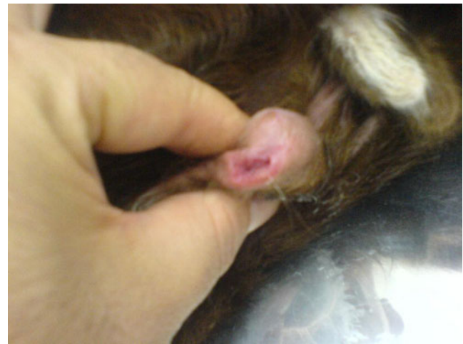
Fig. 2 Two hours after complete removal of the urine with a needle, the bag contained urine again. Pay attention to the lack of a urethral process