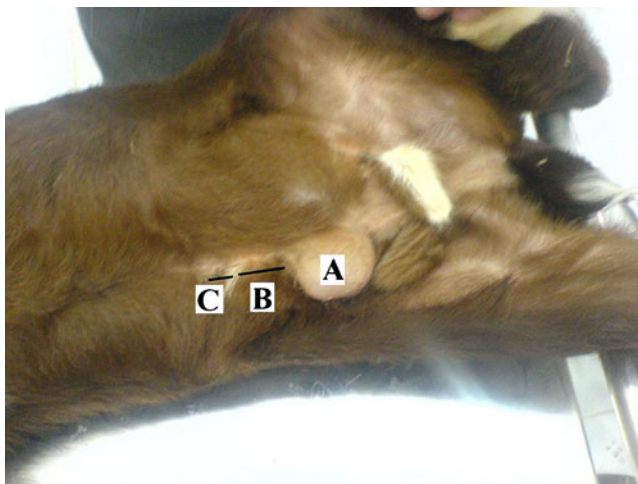
Fig. 1 A bag containing urine (penile diverticulum; a), where the urinary tract was not formed (agenesis; b); the penile urethral channel was open (c)